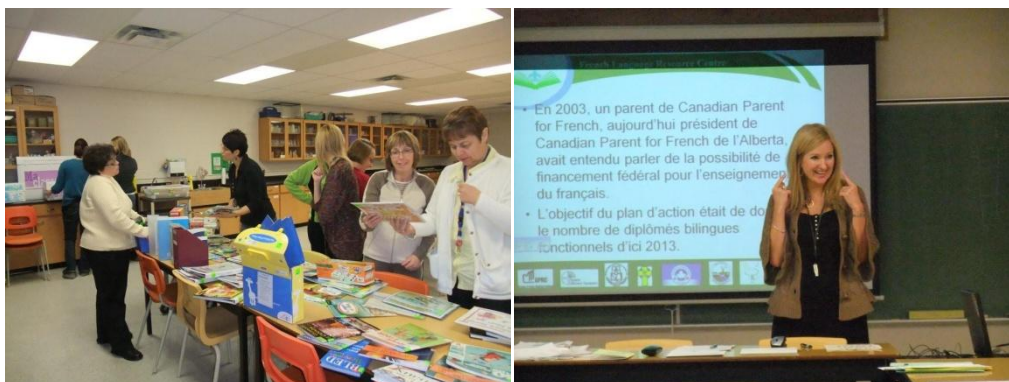
Successful day at École Routhier in Falher bringing up some resources and sharing what the Centre has to offer to teachers new to our collaboration